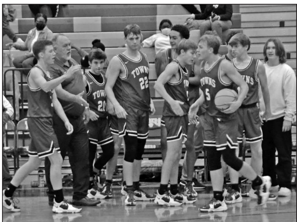
The Indians celebrate after opening 2022 with a Region 8-A victory at Washington-Wilkes over the weekend.